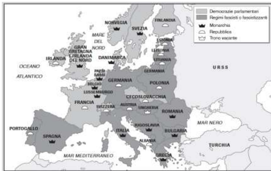
Figure 4- The spread of fascism in Europe in 1937

Or more simply because they realized that the two tyrants in their delirium of conquest and domination were assuming dangerous expansionist aims, had convinced that they could submit to their tyranny the whole world Fig.4, and therefore they had to be stopped.