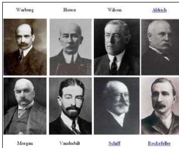
Figure 2- The main leaders and supporters of Nazi Fascism

We refer ourselves to the reading of the article for a thorough examination of this shameful page of European history.