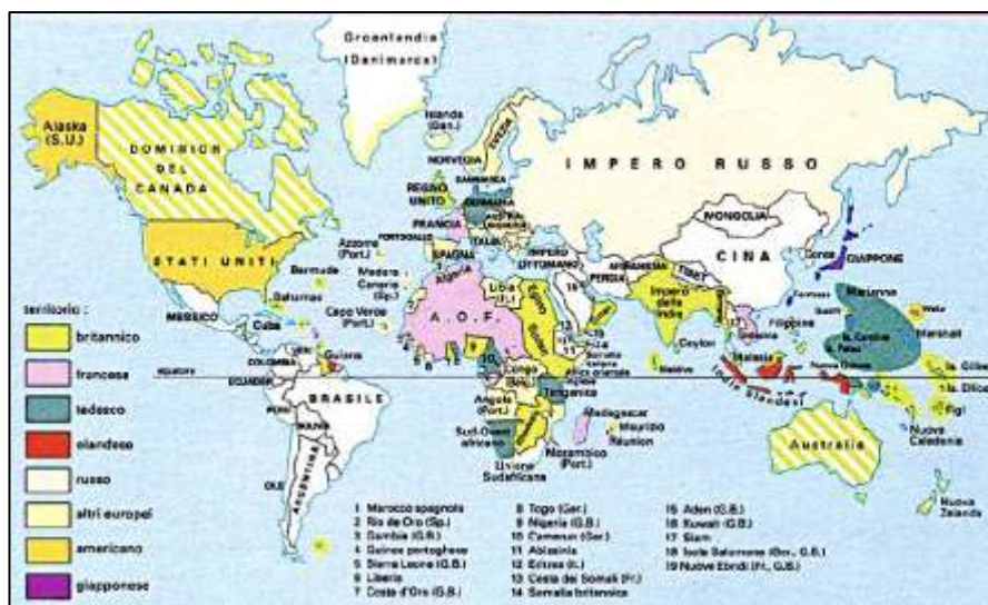
Fig.3- 1900 The world governed by Europe

To remain adherent to the descriptions of the colonial and imperial enterprises of the early '900 we report the map of the occupied colonies that gives a plastic image of how widespread was the colonial occupation by the great powers Fig. 3.